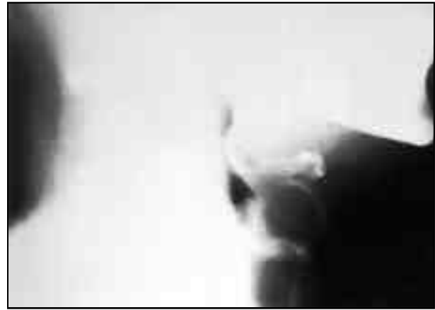
Fig. 2: X-ray soft tissue neck showing epiglottic cyst