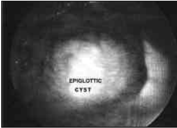
Fig. 1: Fiberoptic examination of epiglottic cyst